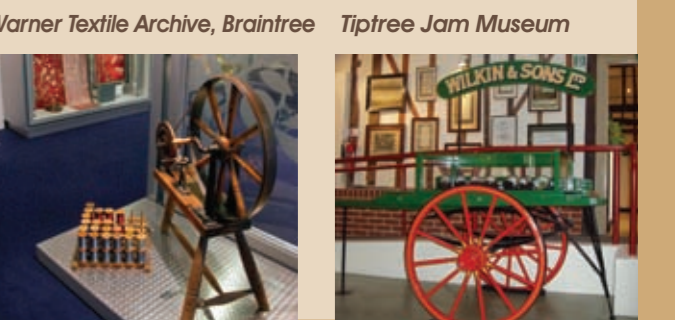
Warner Textile Archive, Braintree Tiptree Jam Museum

With over 14,000 listed buildings, Essex is unusually well supplied with interesting architecture of all shapes and sizes. These range from major landmarks, such as Audley End House, to a wealth of architectural gems in towns and villages such as Coggeshall, Saffron Walden, Great Dunmow and Thaxted, where half-timbered merchants' houses and vast, beautifully decorated churches stand as testament to the wood trade which brought prosperity in the Middle Ages. More ancient landmarks have also survived: from the world's oldest wooden church at Greensted and Bradwell's tiny Saxon chapel to Cressing's vast medieval barns and Heddingham's Norman keep. All this is combined with a legacy of watermills and windmills (285 in the late 1800s) as well as a more recent legacy of inspirational gardens which beckon exploration.