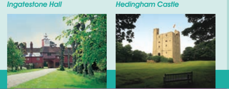
Ingatstone Hall Heddingham Castle